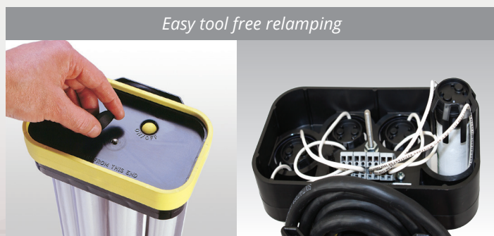
Easy tool free relamping